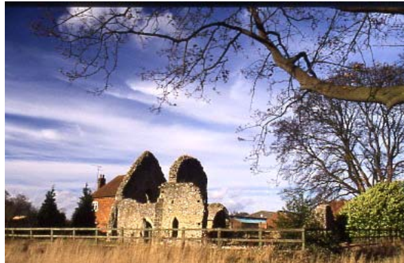
Ruined church of St Etheldreda, Chesfield

If you turn left at the road (7), walk for 100 m, turn left again onto a tarmac drive and walk for a further 70 m you will see the ruins of St Etheldreda's church, viewable from the roadside. This church was in existence by 1216, but what you see is an early fourteenth-century single cell chancel, nave and SE chapel. The church was dismantled and deconsecrated in 1750 and is now on English Heritage's register of 'Buildings at Risk'. If you look over the other side of the road you will see a large quarry pit, most likely the source of flint for both church and manor house.