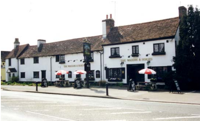
The Wagon and Horses, Graveley

The walk begins at the Wagon and Horses pub (number 1 on the map), which is a sixteenth-century timber-framed coaching house with a fine original fireplace and an equally fine selection of beers. From the entrance turn left into the High Street and in 30 metres cross the road at the three-bay early 18th-century house called the Grange and into Church Lane.