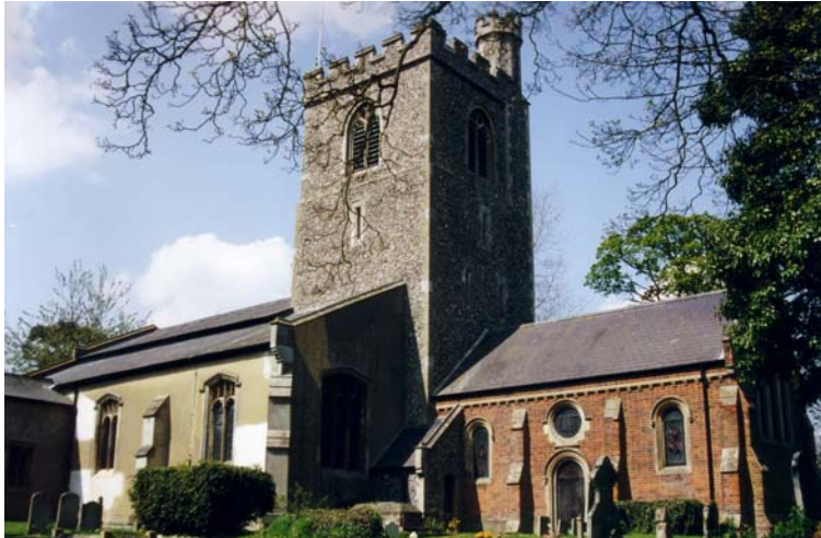
Holy Trinity Church, Weston

Carry along this well marked path until it comes out from under the shade of trees by Cow Mead house, and continue through the kissing gate of Holy Trinity parish church, Weston (5). This has a Norman crossing dated to the early twelfth century with a tower sitting on top, of which the lower portion is of the same date. The upper part of the tower was rebuilt in 1867. The piers and arches in the crossing are extremely good examples of the Norman style with complex capitals. The nave is fifteenth century in the Perpendicular style with its ceiling beams resting on interestingly grotesque corbels. The chancel was rebuilt in 1840 by Thomas Smith in the Norman style. There is also a late fourteenth-century font with quatrefoil panels. Just inside the east gate of the graveyard you will find two small stones about 4m apart reputedly marking the grave of Jack O'Legs. He was a fourteenth-century brigand who would rob travellers on the Great North Road (probably giving his name to Jack's Hill, north of Graveley) before repairing to his cave in the woods that then covered the Weston Hills. When finally caught and taken to the gibbet on Jack's Hill he was allowed one last request – which was to fire his bow and to be buried where the arrow fell. It hit the tower of Weston church and landed inside the east gate.