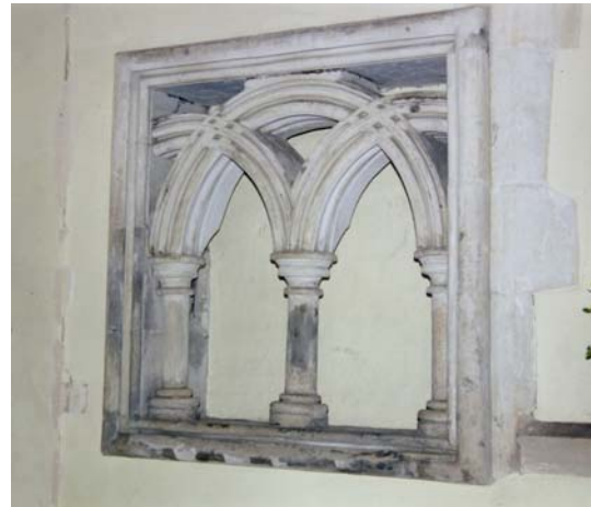
Double piscina, St Mary's church, Graveley

Pass Graveley Bury Farm on the right, which has an important series of barns dating to the seventeenth century (with nineteenth-century additions), and turn left onto a small lane signposted for the Hertfordshire Way. St Mary's Church is now before you (2). This is a fine example of a medieval flint church, common in Hertfordshire, and it is usually left unlocked for visitors. The chancel has good Early English style lancet windows of the thirteenth-century with a Perpendicular fifteenth-century window inserted on its south side – later heavily restored in the nineteenth century. There is a very impressive thirteenth-century arched double piscina to the S of the altar, which was used for the disposal of holy water after mass. It seems to have been copied from the piscina in Jesus College chapel, Cambridge. The west tower is also thirteenth or early fourteenth century while the nave windows date from the fifteenth century, in the Perpendicular style. The north aisle was added in 1887. There is an interesting nineteenth-century grave slab on the south side of the chancel laid down for the three wives of the Rev Thomas Fordham Green, and a fine epitaph urn and obelisk monument to Margaret Sparhauke dated 1770.