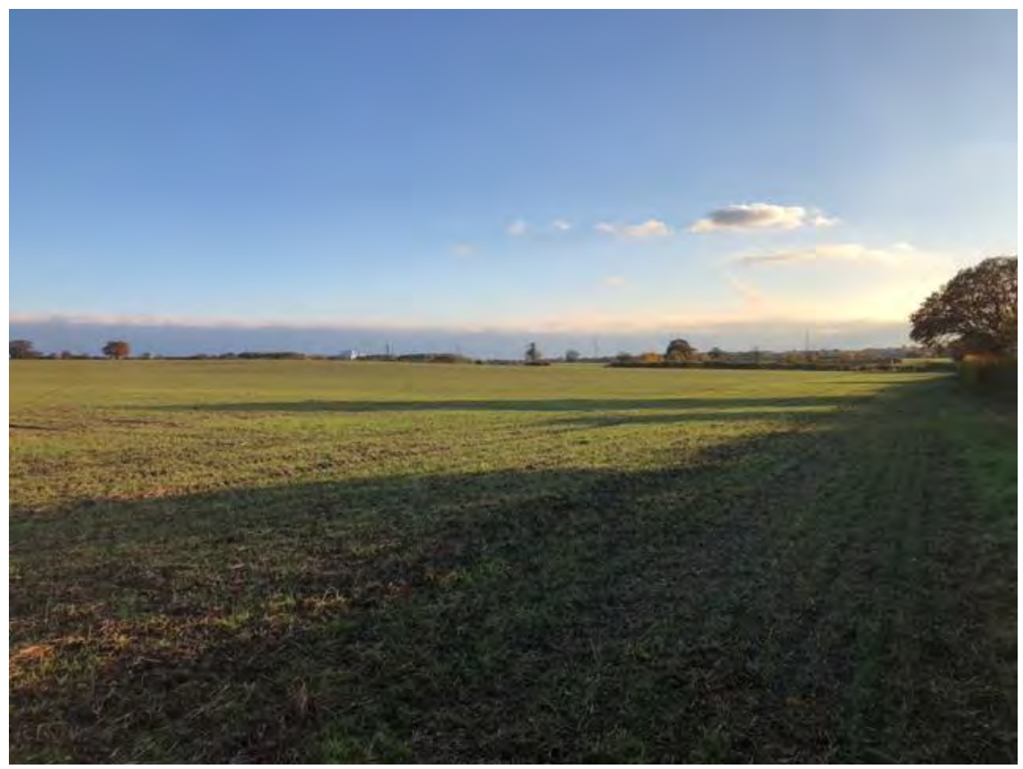
Plate 7 – Field 4 west facing southeast