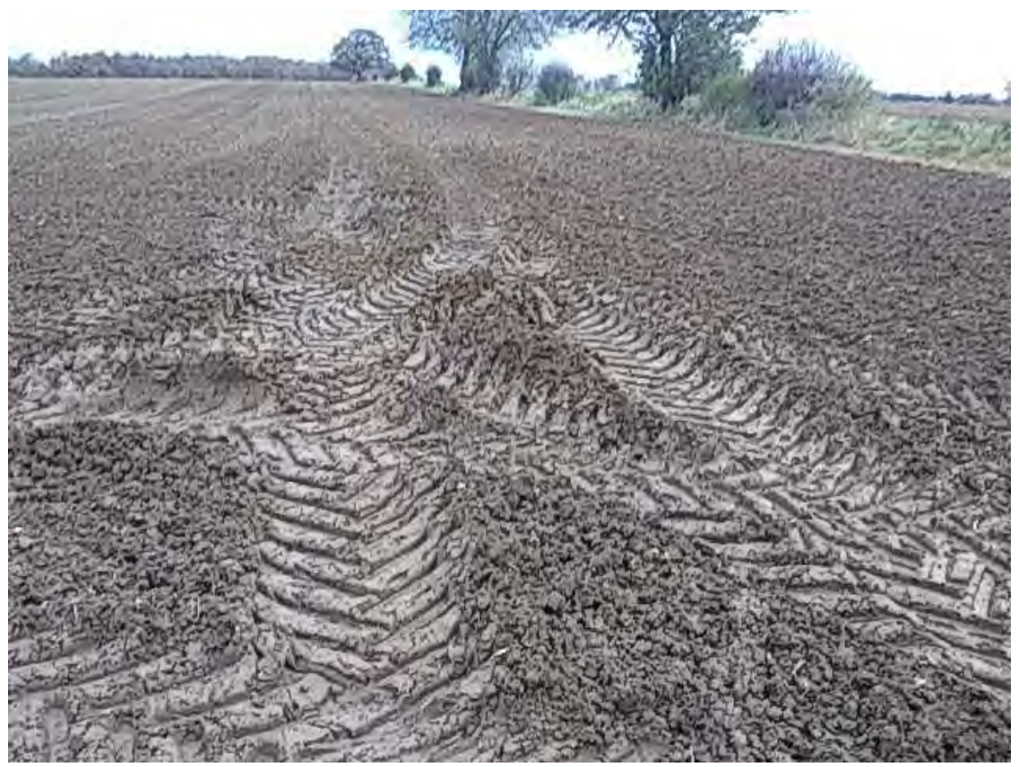
Plate 5 – Unsurveyable terrain field 2, southeast corner