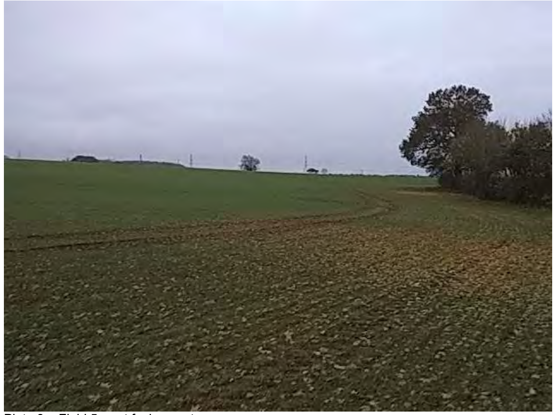
Plate 8 – Field 5 west facing east