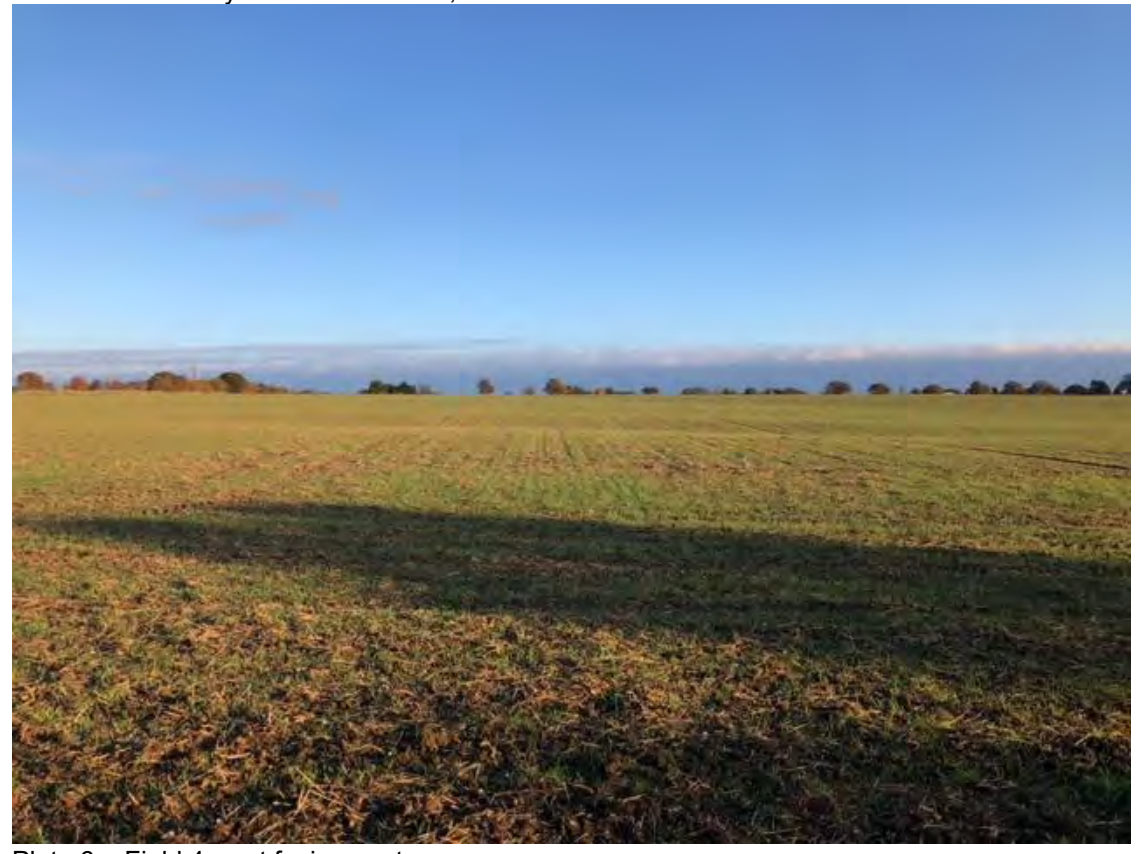
Plate 6 – Field 4 west facing east

Plate 5 – Unsurveyable terrain field 2, southeast corner