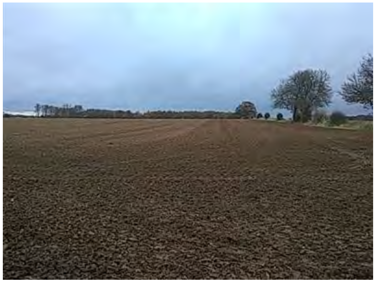
Plate 3 – Field 2 south east facing north