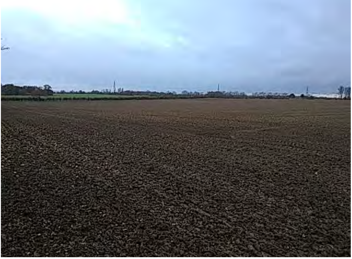
Plate 4 – Field 2 south east facing northwest