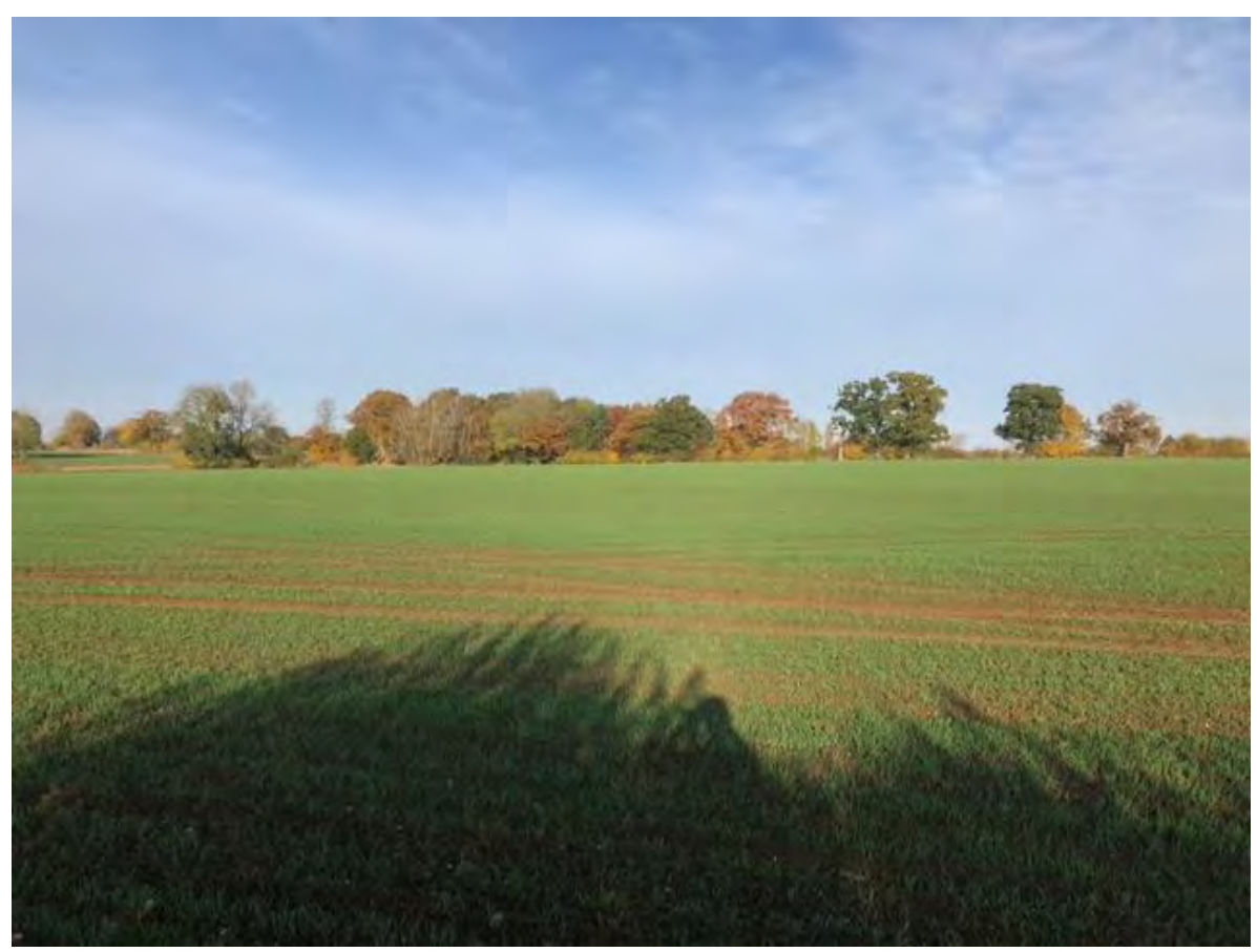
Plate 1 - Field 1 South facing north