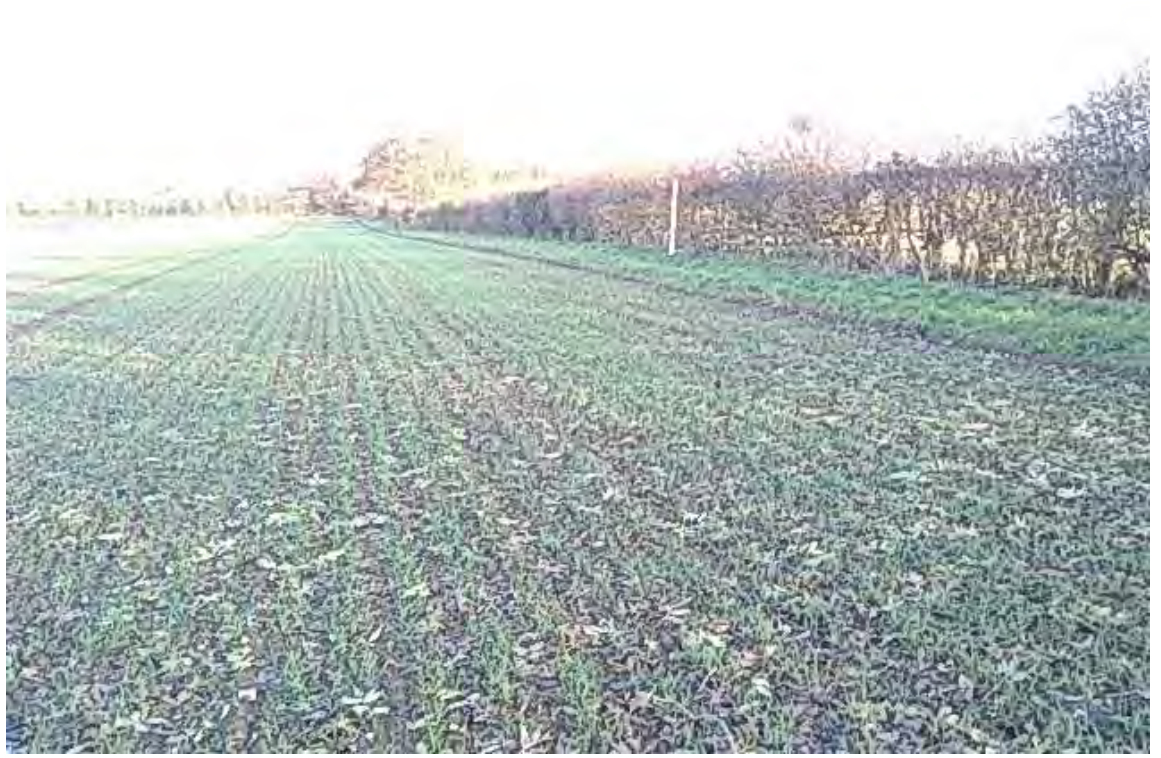
Plate 9 - Field 5 south facing east including service marker