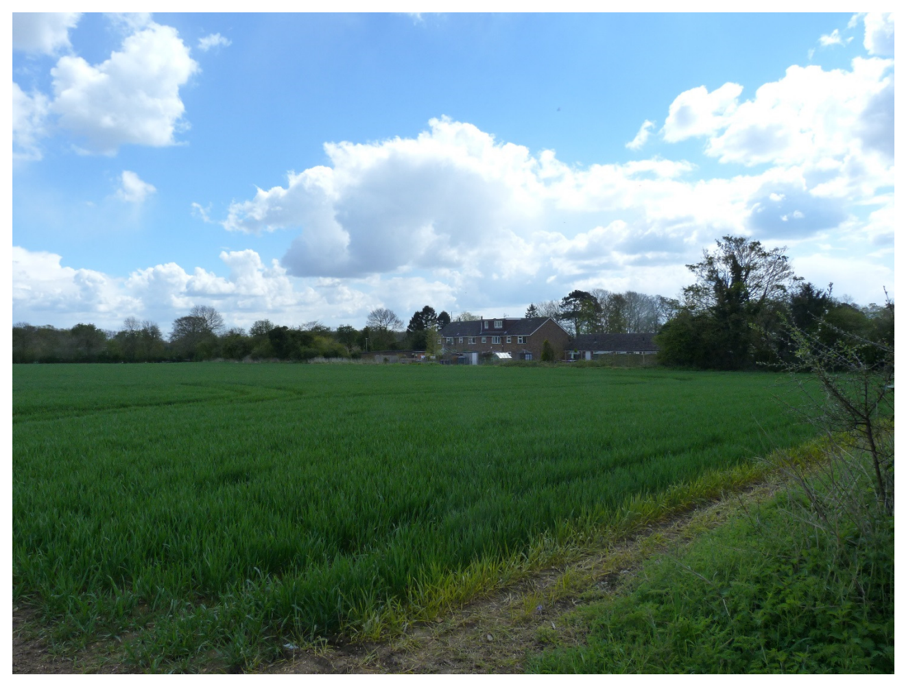
Plate 4: View south towards the conservation area across the proposal site adjacent to Royston Road, Site 22