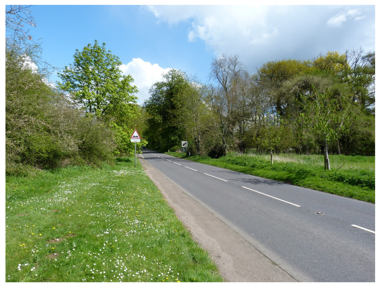
Plate 2: View north up the Cambridge Road showing the boundary of Site 19 to the west of Cambridge Road and tree planting at the west boundary of Cokenach Registered Park and Garden