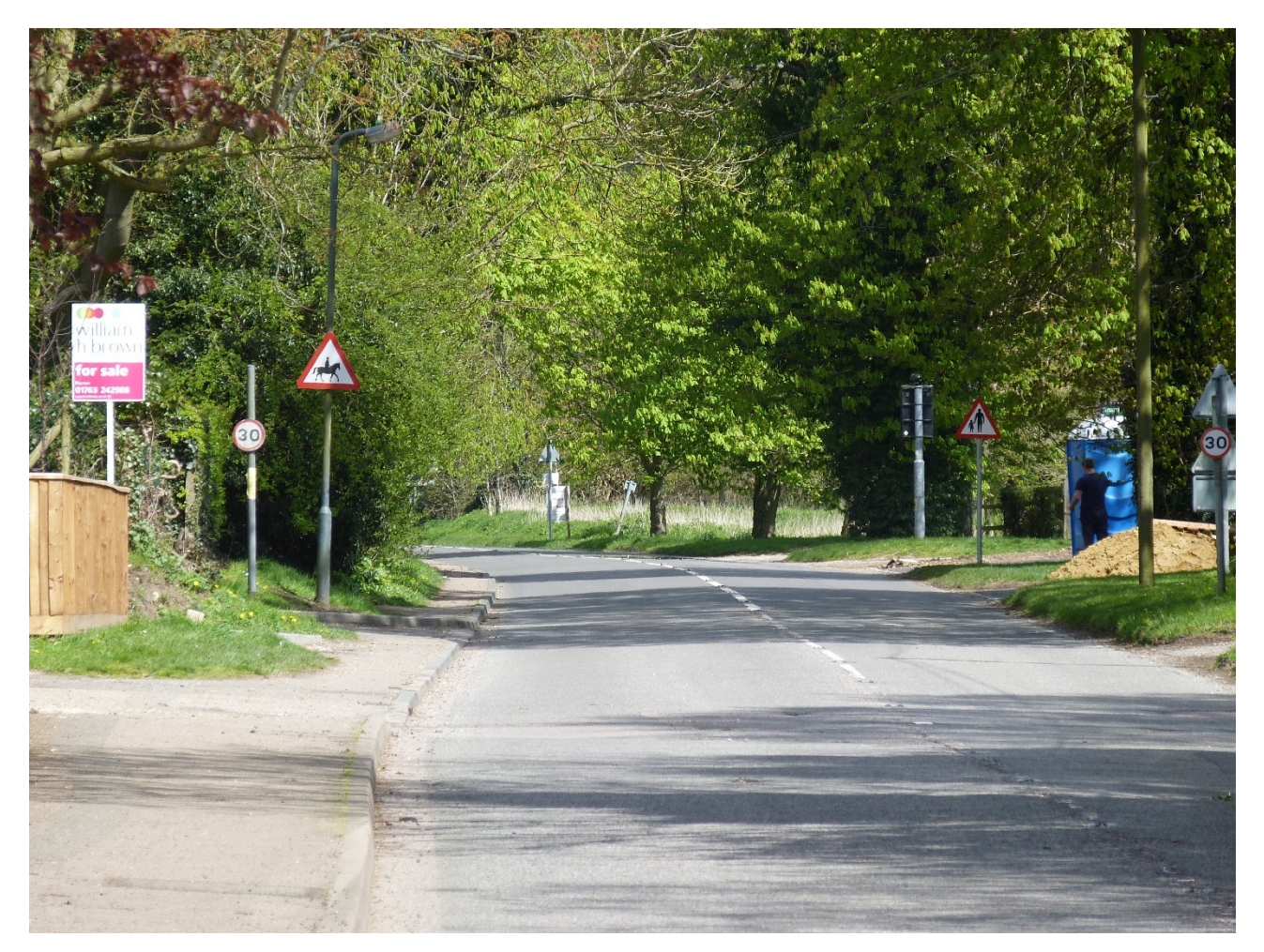
Plate 6: View of proposal Site 18, east of the Cambridge Road showing gaps in tree coverage and trees within the Cokenach Registered Park and Garden behind