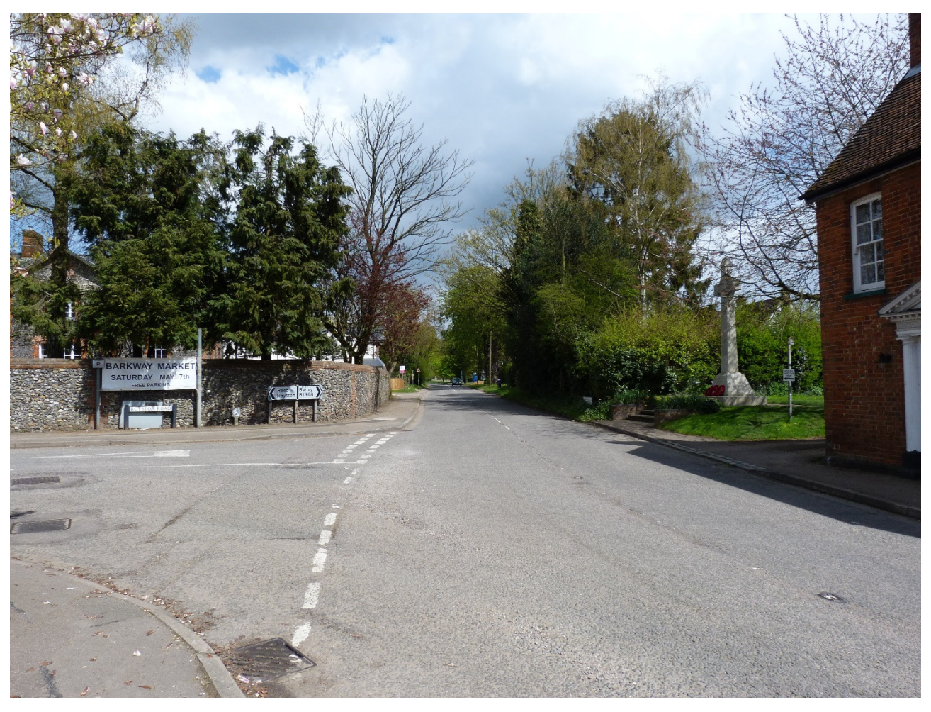
Plate 5: View north from grade II* listed No 2 High Street towards proposal Site 18