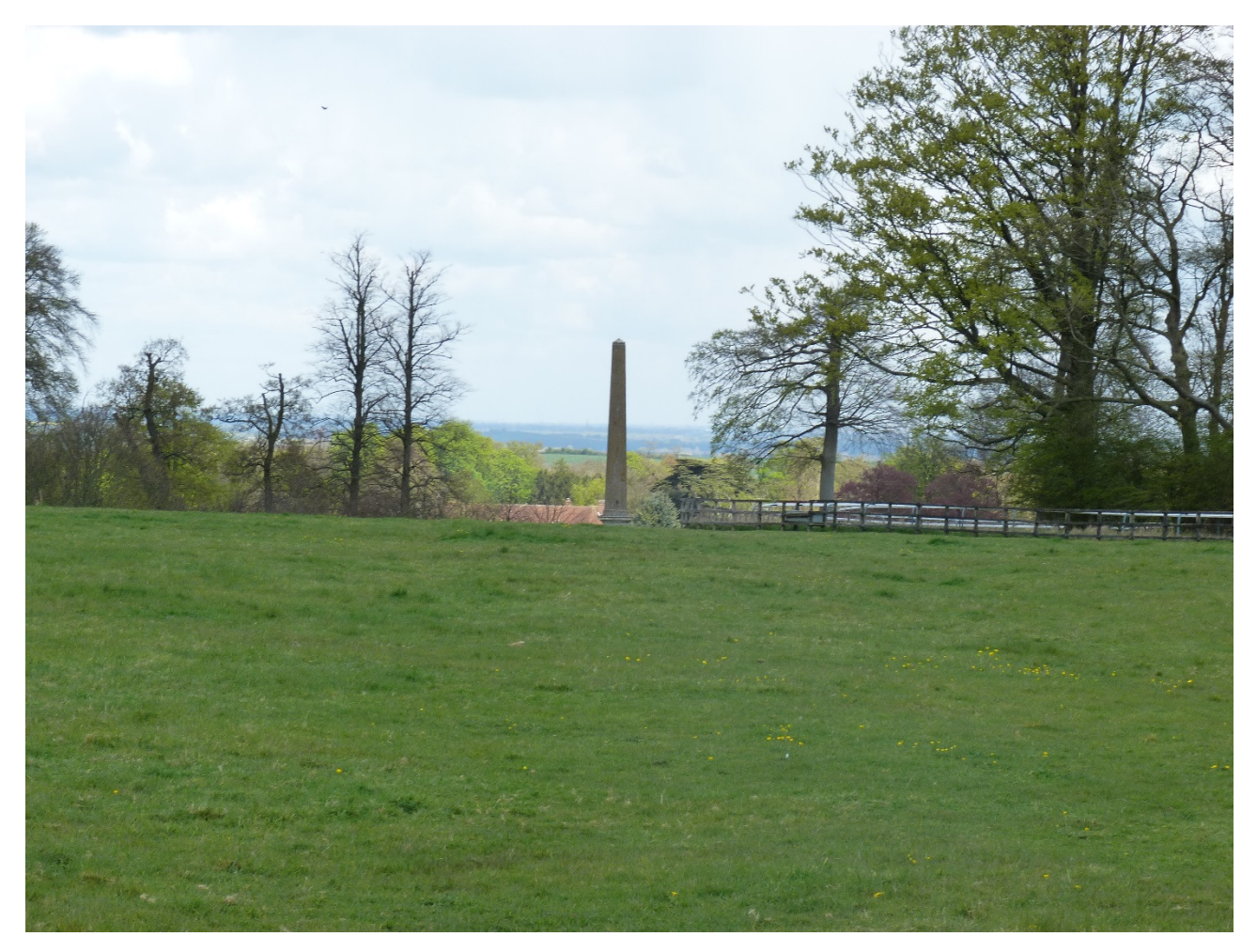
Plate 3: Grade II listed Obelisk 350m south, south west of Newsells Park House (Not Listed) viewed from the north boundary of the Site 19, photograph zoomed in