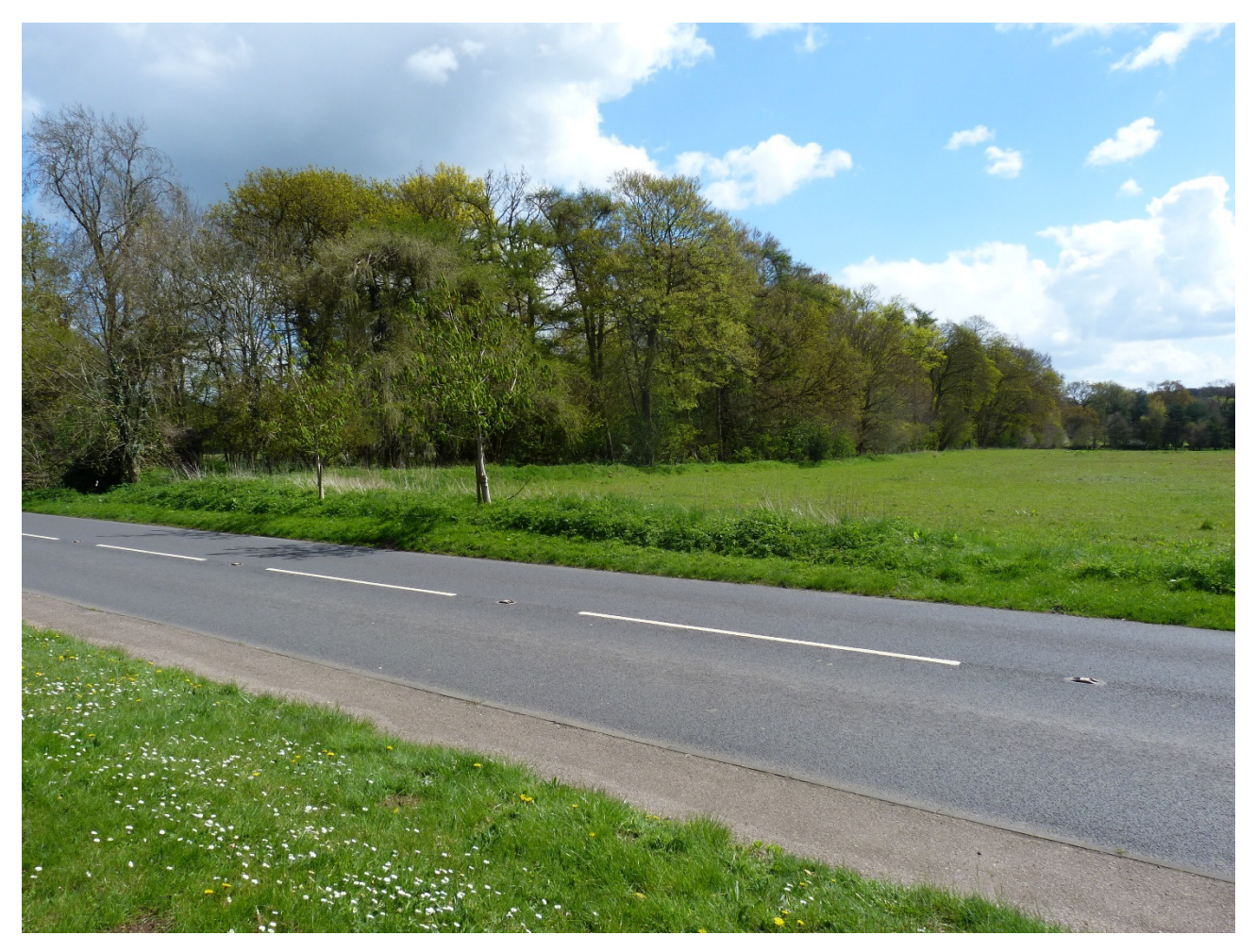
Plate 1: Proposal Site 18 located east of Cambridge Road and the tree belt making out the south extent of Cokenach grade II Registered Park and Garden