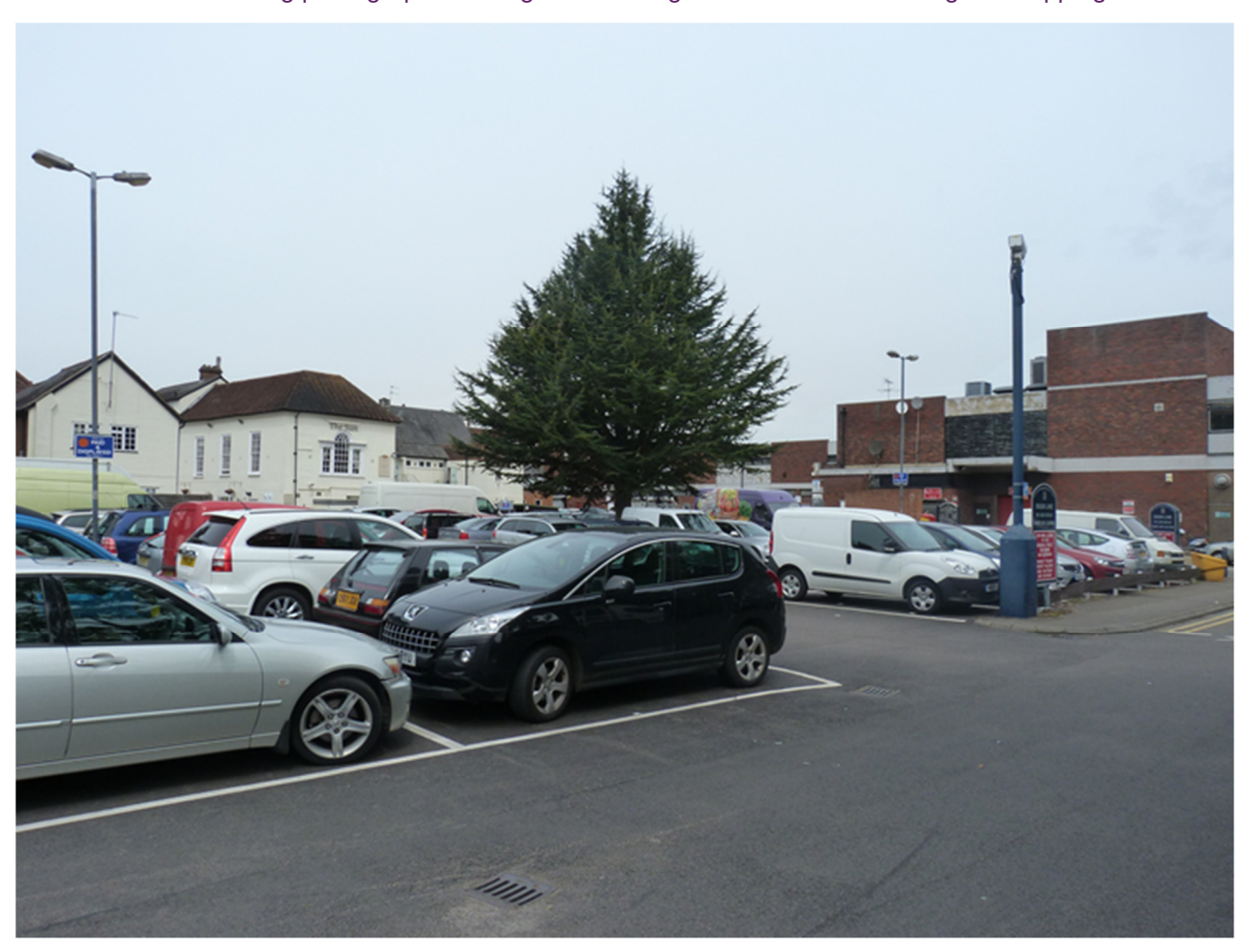
Plate 1:Northwest facing photograph showing service range for the 1970s Churchgate shopping centre.