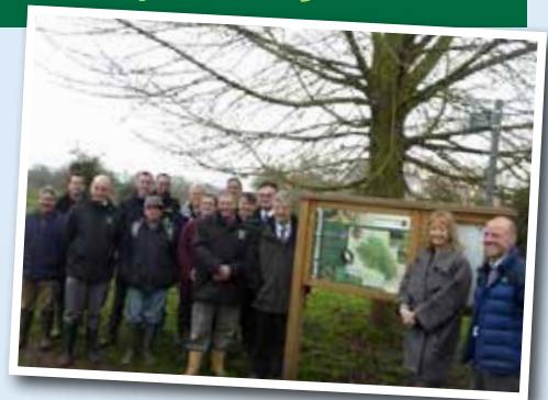
The opening event at Purwell Meadows in December

Local volunteers under guidance from CMS have carried out a huge amount of work, resulting in a real benefit for the wildlife and enabling local residents to wander around and appreciate all the improvements the area.