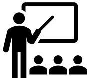
Opportunities for development