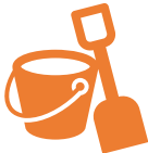
Holiday purchase scheme