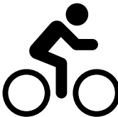
Bike to work scheme