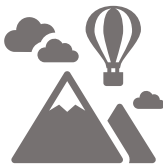
Generous annual leave allowance