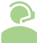
Employee assistance programme