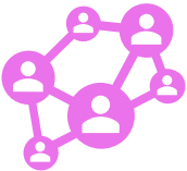
Staff consultation forum