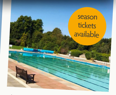
LETCHWORTH OUTDOOR POOL