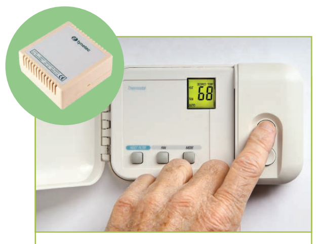
Ambient temperature monitor used to detect abnormal temperatures, or a sudden rise or fall in temperature if someone has difficulty managing the warmth of their home