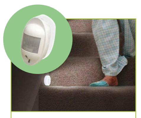
Passive Infrared Sensor (PIR)

to ensure a person has returned to their bed or a room during the night