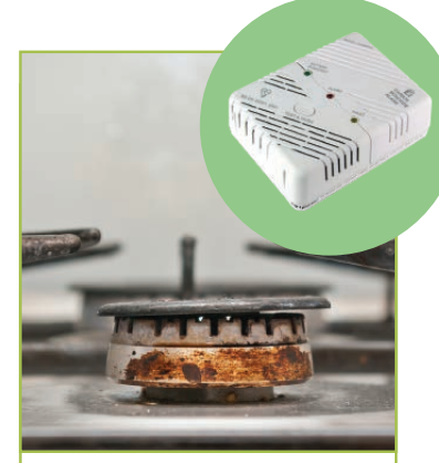
detector used to sense dangerous levels of carbon monoxide associated with gas appliances