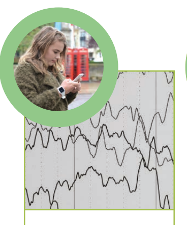
For complex epilepsy and another neurological conditions