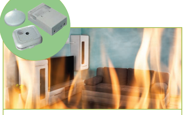
Deaf smoke alarm / vibrating pad a smoke alarm kit exclusively for those with hearing issues. If a fire is detected the smoke alarm sounds, the strobe light flashes, the pillow pad vibrates and an alarm call is triggered