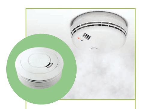
Smoke detector a potential life saver for when there's a threat of fire