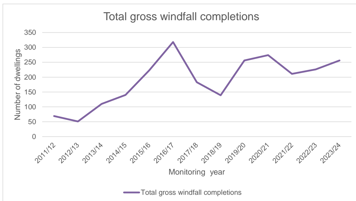
Fig 3 – Total gross windfall completions since the start of the Plan period

period in 2011. This is shown in fig 3 which illustrates the number of sites classified 'windfall' through the development management process and as recorded by Hertfordshire County Council.