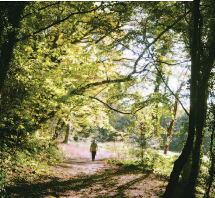
A walk through the woods

Anyone interested in joining the group should contact the Countryside Management Service.