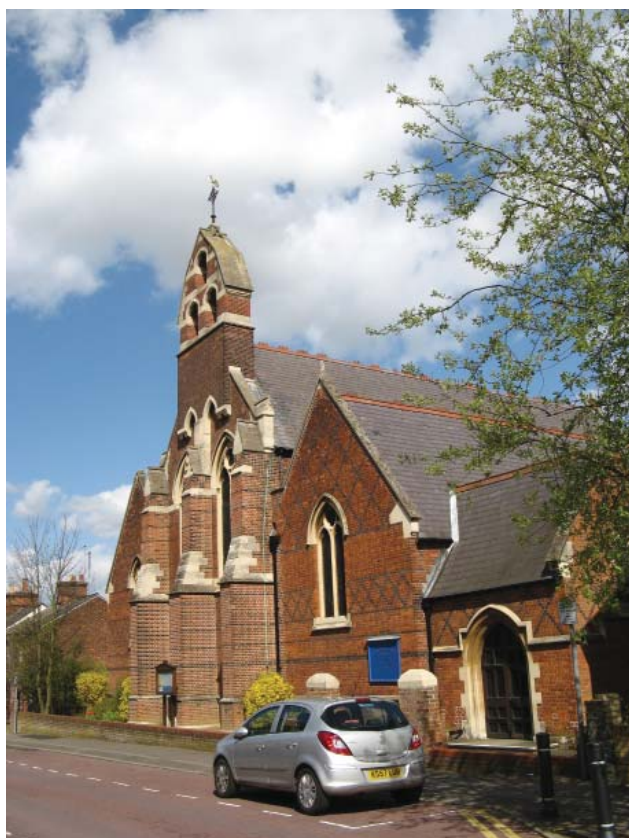
Church of the Holy Saviour, Radcliffe Road