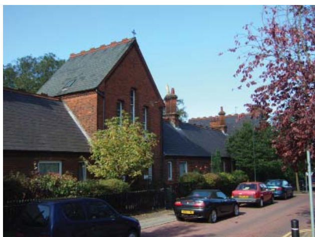
The Cloisters, Radcliffe Road

On the north side of the street, nos. 43 to 46 (consec) are an imposing three storey terrace of houses of c1875, with gables facing the street and canted two storey bay windows which are decorated with modillion eaves cornice and foliage capitals to the window mullions. These buildings are all considered to be 'positive'. Again, these properties, and the buildings in Trevor Road and Benslow Lane, should be afforded greater protection. Consequently, an Article 4 Direction is proposed.