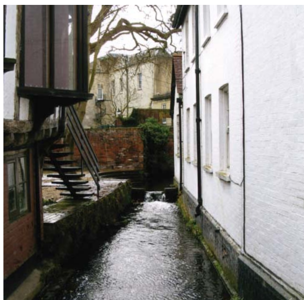
The River Hiz near Bridge Street

Today the river within Hitchin has in recent years been much improved and walkways provided. Firstly, in Bridge Street where a new development has recently been completed. Secondly, around the back of The Biggin and the adjoining housing development (Jill Grey Place), where the setting of both the new and old buildings has been enhanced by new landscaping, including new trees and a private pathway. Thirdly, around the eastern side of St Mary's Churchyard, where the 1920s improvements included damming the stream to create a lake in front of the church. This lake, with its ducks and swans, provides one of the defining images of Hitchin for the visitor arriving at the adjoining car park. Fourthly, as part of the new Sainsburys Supermarket car park and the adjoining residential development in Whinbush Road, where the river has again been 'tidied up' and new walkways and planting provided. This is the section of the river which was diverted in the medieval period. The provision of a riverside walk through the whole of Hitchin is a long term goal, which is in part set out in the River Hiz Development Brief, published in 1995. This includes the provision of a riverside walk from Bridge Street to Hermitage Road and beyond to Sainsbury's and residential development across the river.