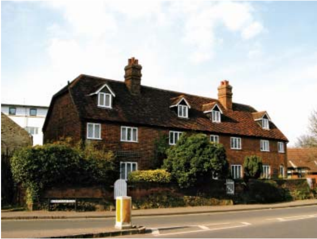
Nos. 1 - 4, Nightingale Road (listed)