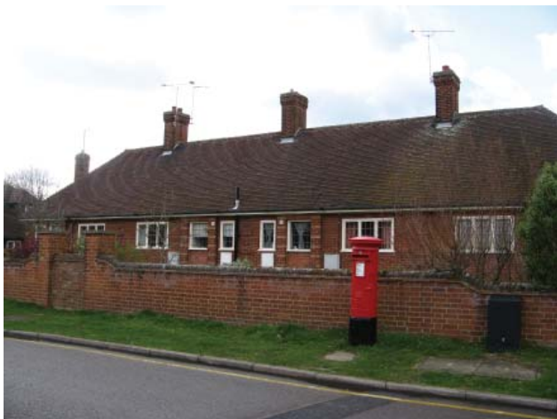
Almshouses on corner of Wratten Road East and Old Charlton Road

Another interesting inclusion is the almshouses on the corner of Wratten Road East and Old Charlton Road. These single storey buildings were built in the 1930s and are well detailed, retaining their original clay roof tiles. The two buildings are the same and sit at right angles to each other, turning the corner which marks the junction between the two roads. Whilst the windows have been replaced in uPVC, the original window openings remain unchanged and the style and details of the modern replacements are not out of character. The original front boundary, built of matching red brick with a curved brick coping, also remains.