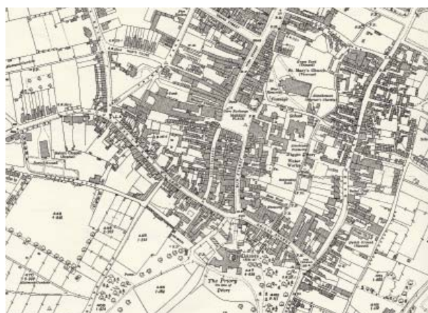
Historic Map of 1923