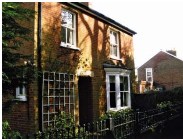
Cottages in Hitchin Hill

The original road to Charlton, called Mill Lane after the malt mills located nearby, runs between The Priory pond and no. 1 Tilehouse Street. The Priory was extensively rebuilt in the 18th century when the parkland was laid out and the River Hiz dammed to provide a lake. The Hitchin Relief Road (Parkway) now crosses this parkland.