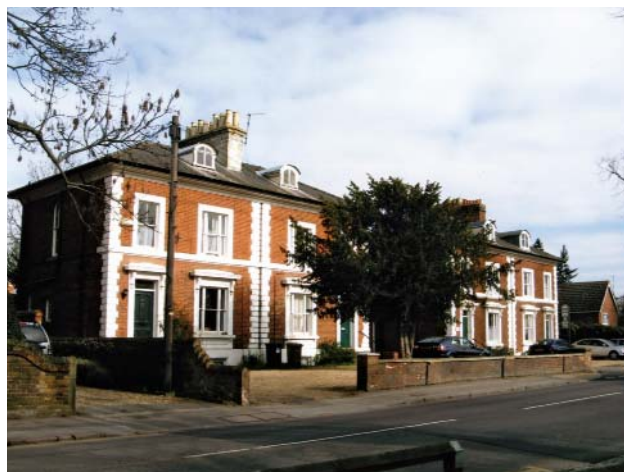
Substantial villas in Walsworth Road

The pronounced topography of Windmill Hill provides exceptional views across Hitchin and during weekday lunch hours, weekends or at evenings, when the weather is fine, the Hill attracts significant numbers of young people who congregate and socialise in small groups, although other users of 'the hill' are also in evidence. As a popular and well used local facility, Windmill Hill is therefore as much a defining characteristic of Hitchin as the Market Place and the historic area around the church.