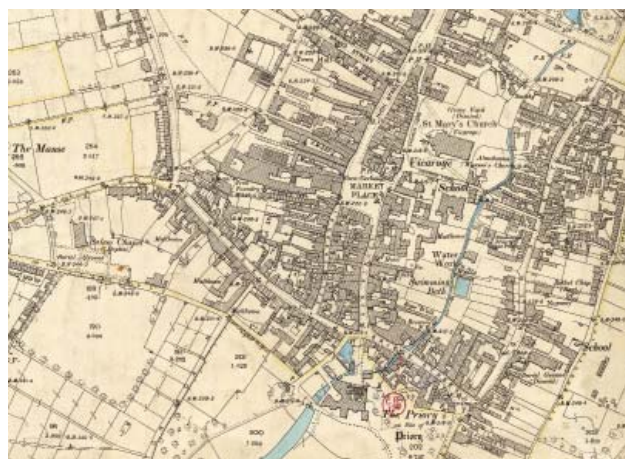
Historic Map of 1898