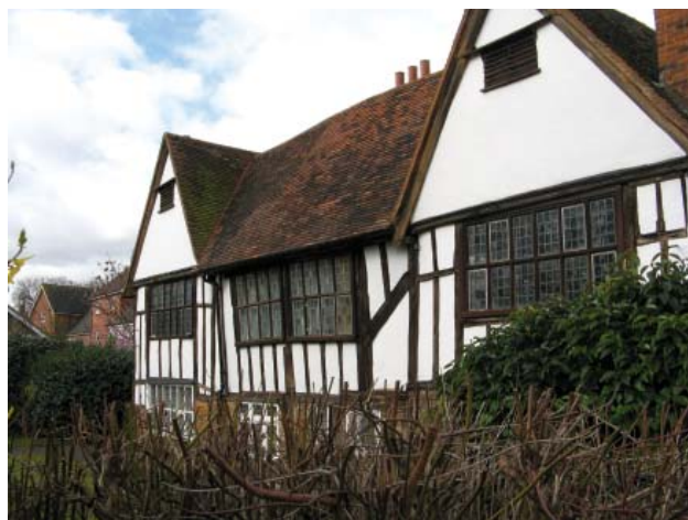
The Biggin, off Queen Street