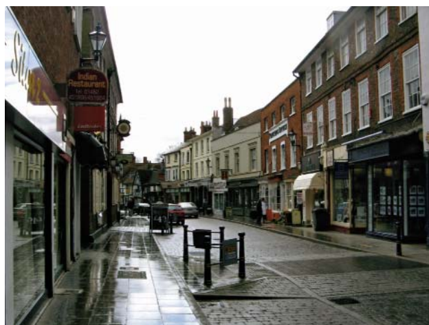
Shopfronts are extremely important in the conservation area (Sun Street)