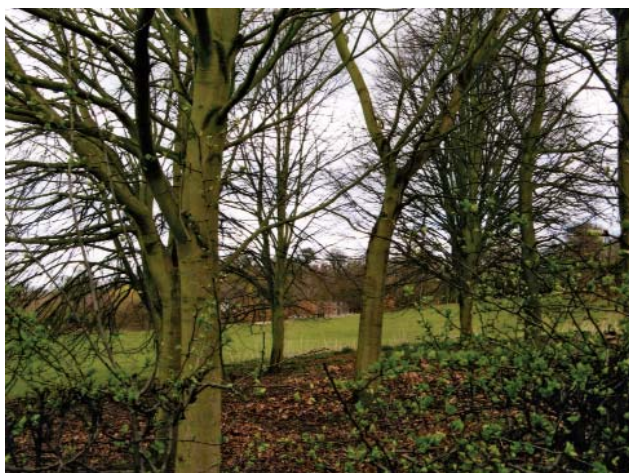
The grounds and house in Priory Park can be glimpsed from the public footpath

Priory Park makes up the largest area of open green space in the Hitchin Conservation Area, and although it is not normally open to the public, views from the surrounding footpaths into the park are of note. The Priory Conference Centre (listed grade I) is located close to the town, and incorporates some of the 15th century cloisters from the early 14th century monastery which was founded in 1317 for Carmelite monks. The Priory also provides a venue for weddings. The buildings were located close to the River Hiz (to provide a supply of water and a drain) and also to a ford over the river, below what is now Bridge Street. The River Hiz makes a positive contribution to the appearance and character of the Park.