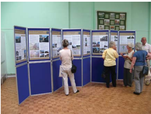
Stakeholder's meeting, March 2009

The District Council has already produced a number of documents relating to Hitchin, including the River Hiz Development Guidelines 1994, the Hitchin Town Centre Strategy 2004, the Churchgate Development Area Planning Brief 2005, the Paynes Park Planning Brief 2005, and the Urban Design Assessment for Hitchin 2007. The Hitchin Town Centre Strategy is subject to regular review and one of the purposes of this Character Appraisal is to feed into that review process.