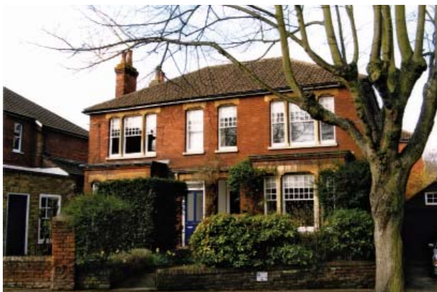
Detail of house in The Avenue