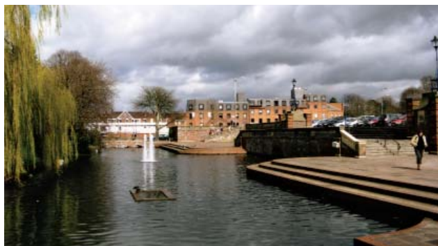
St Mary's Square

Although Hermitage Road was created in the 1870s it was not developed with buildings until the 1920s and is a fine example of an Inter-war shopping parade contributing positively to the architectural and visual quality of the street. The mock Tudor buildings at each end on the north side of Hermitage Road provide focal points. Medieval glass panels form a window of some interest above the entrance to no.112 Bancroft at the western end of Hermitage Road. At the east end of Hermitage Road and on the south side, a building successfully addresses this prominent corner and provides a focal point. The Inter-war ranges on both sides of the road are regarded as Buildings of Local Interest.