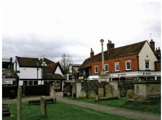
View from the churchyard towards the Market Place