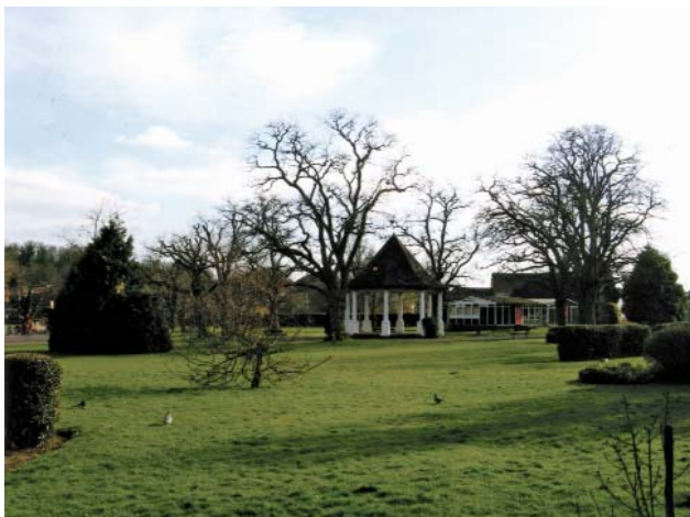
Bancroft Recreation Ground