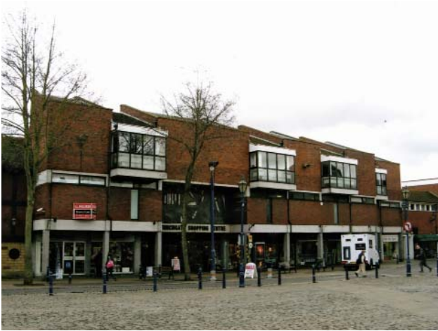
Churchgate Shopping Centre