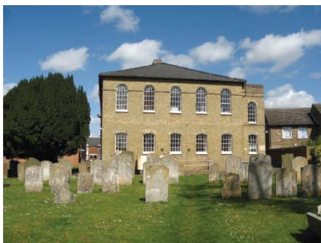
Baptist Chapel, Upper Tilehouse Street

Where Parkway intersects Tilehouse Street, a small garden has been created. This was opened in September 1952 as the Hitchin Urban District Council memorial to the well known Hitchin historian R L Hine and is therefore known as the Hine Memorial Garden. The Garden is on the site of the former Free School and is enclosed by a large ornamented red brick wall on the east side, and includes a stone and bronze plaque to R L Hine. Original and replica benefactor plaques also exist, however, the original curved benches are now missing. Western House (grade II* listed) stands opposite The Garden and is listed grade II*. It has a blue plaque on the front elevation which reads "George Chapman – poet, playwright and translator lived here 1559-1634". There is a distinct sense of quiet and stillness in Tilehouse Street which contrasts quite markedly with that of Upper Tilehouse Street on the opposite side of Parkway. Many of these listed buildings once had long back gardens which have incrementally been lost to development, for example on the south side of Tilehouse Street, where Wratten Road East provides access to new buildings.