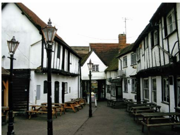
16th Century timber-framed building with back court (Bucklersbury)