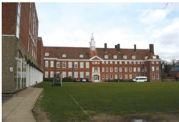
Hitchin Girls' Grammar School (BLI)

North Hertfordshire District Council currently maintains a Register of Buildings of Local Interest (BLIs), more commonly referred to as 'locally listed' buildings, many of which lie within the Hitchin Conservation Area. This was first compiled between 1997 and 1998. Some of the buildings date to the late 19th or early 20th century and are interesting examples of local vernacular styles or materials. They may also have particular significance for their association with local people or a local historical event, or have social or political significance. Examples include the imposing 1908 Hitchin Girls' School on Windmill Hill, as well as the more modest row of late 19th century shops which face Arcade Walk off the Market Place. The criteria for selecting BLIs is given in the Register .