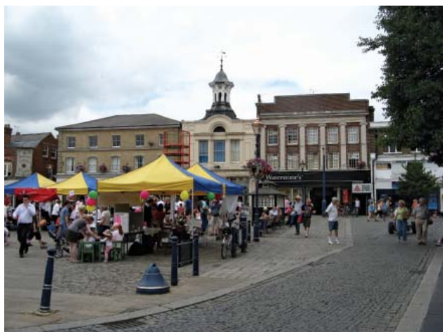
The Market Place, Hitchin