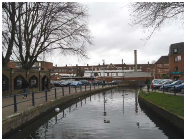
The River Hiz, Hitchin Town Centre

The North Hertfordshire and Stevenage Landscape Character Assessment (2005) identifies three Landscape Character Areas around Hitchin as follows: