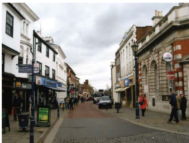
Improvements to the public realm in the town centre are needed (High Street)

It is not surprising that many of the 'Issues' identified in the Strategy of 2004 remain, and that this Character Appraisal is in many cases merely reiterating concerns put forward five years ago.