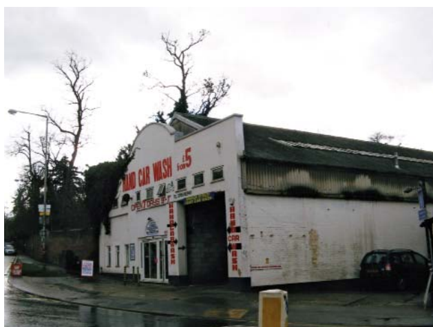
The former Bus Garage, No.22 Bridge Street