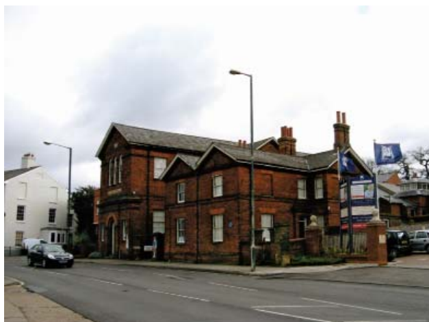
The former British School, Queen Street

Almost opposite these are a particularly fine group of historic buildings made up from no. 40 - an early to mid 19th century stuccoed villa (grade II listed), the Bethel Chapel of 1869 (a Building of Local Interest), and the British Schools of 1857/8 (the frontage buildings which are grade II listed). Part of this complex has now become a national museum of education. The schools were founded in 1810 but the oldest surviving building is the unique Lancasterian school room built in 1837 to facilitate the monitorial teaching system. Further buildings were added in 1857/8. The significance of the site was realised by local historian Jill Grey in the 1970s, and the development of new houses on the opposite side of the road is named in her memory. Other buildings of note include the locally listed Bethel Chapel, built c1869-70, and an example of a simple Particular Baptist chapel building representing an important element of Hitchin Non-Conformity. Next door, nos. 37 and 38 Queen Street are a symmetrical pair of late 19th century cottages. Once known as West View and Titmore Cottage, they were built by George Edward and Walter Jeeves, whose father George Jeeves who was responsible for the building of nos. 66, 67 and 68 Queen Street in 1875 (now listed) on the opposite side of the road.