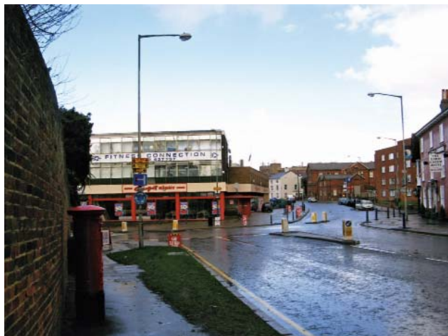
The main approach into Hitchin Town Centre from Park Street is disappointing

Many stakeholders felt that the main 'entries' into the town were disappointing and failed to reflect the high quality of the historic environment within the town. Improvements were particularly sought at the northern end of Hitchin Hill, where Park Street meets Queen Street and Bridge Street, and along Queen Street, where traffic and modern development dominates.