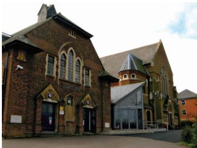
Baptist Chapel, Walsworth Road (BLI)

Working with the District Council, Groundwork Hertfordshire, and local volunteers, the Countryside Management Service implemented improvements to the site and in October 1995 'The Dell' was re-opened. In 1999 an interpretation board for the site was unveiled to provide information about the site. More recently, open air performances have ceased and the earth banks and theatre structures have been damaged by young people using BMX-type bicycles in the area.