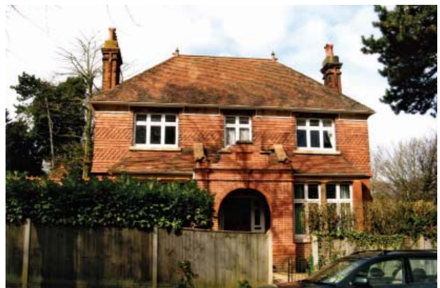
Detail of house in Chiltern Road