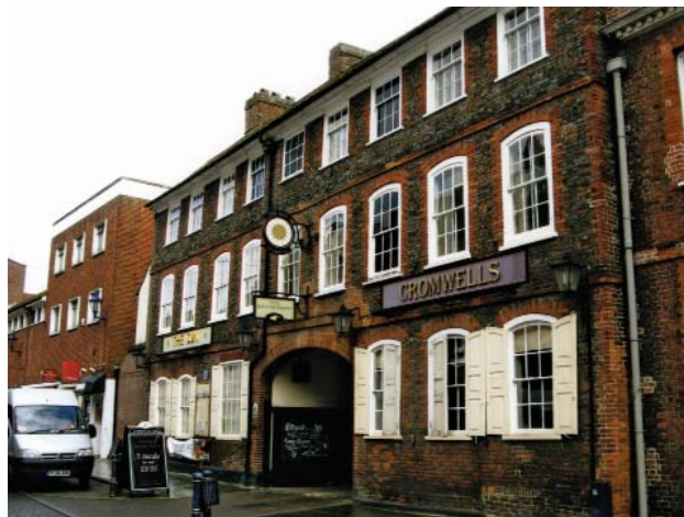
Cromwells in Sun Street

There are a number of public houses or small hotels, particularly in Bucklersbury and Sun Street. The Sun Hotel dates to c1700 and is built using blue brick with red brick dressings and retains its original external wooden shutters. No. 5 Sun Street (grade II listed) was built in c1760 as a house and retains a high quality Georgian façade and internal details of the same period. Part of the land between the rear of these buildings and the River Hiz is a public car park that allow views of the rear of The Sun Hotel (grade II* listed) but makes no positive contribution to the character and appearance of the conservation area. This car park is therefore considered to be an improvement opportunity.