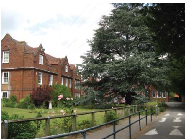
Trees make a major contribution to the special character of the conservation area (Hitchin Boys Grammar School)

The most significant trees are marked on the individual Townscape Appraisal Maps for each Character Area. Because of the high number of trees, many of which are in private gardens, it has not been possible to record every tree. It should therefore not be assumed that the omission of a tree or tree group means that it is of no importance. All trees with a trunk of 75mm diameter at 1500mm above ground level in the conservation area are automatically protected and notification is required to the District Council to lop, top or fell them.