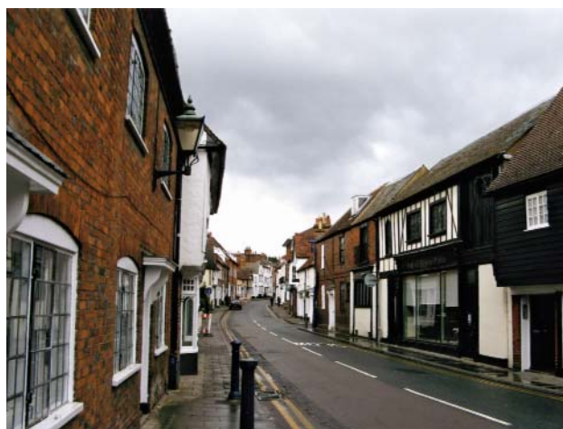
Listed buildings in Tilehouse Street