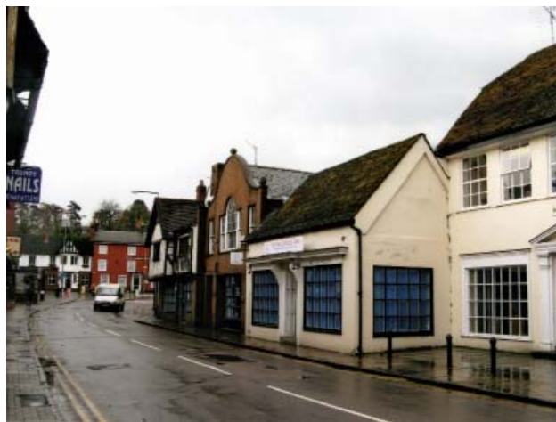
View along Bridge Street