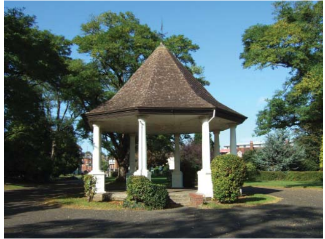
Bandstand in the Recreation Ground (BLI)