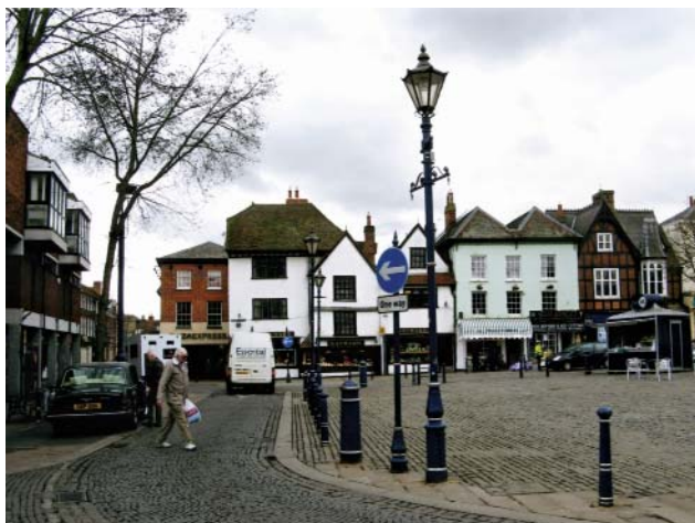
View across the Market Place