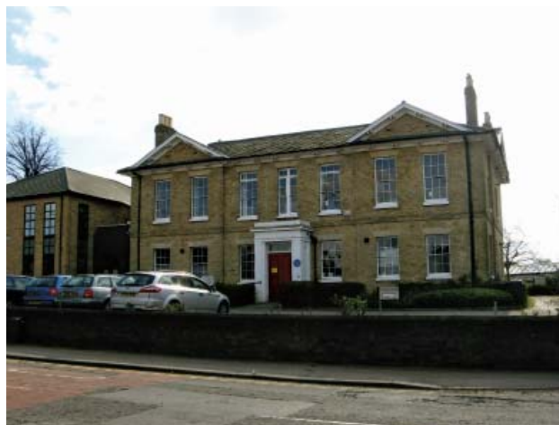
Thomas Bellamy House