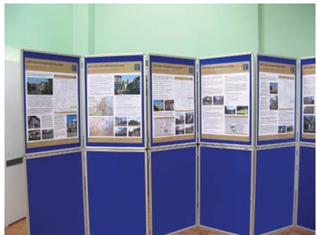
Stakeholder's meeting, March 2009