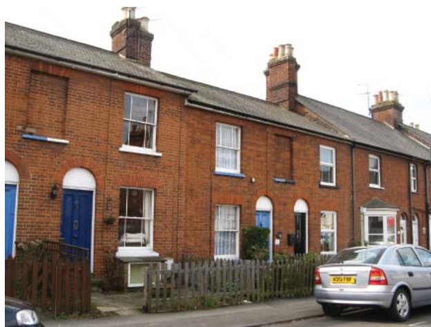
Houses on Trevor Road