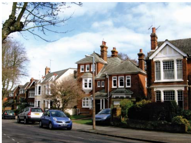
Buildings in The Avenue

examples have fine quality details such as oriel windows, jettied upper floors, and attractive timber porches. Tile hanging and the use of matching red brick is another notable feature. The buildings in Highbury Road tend to be more substantial than those in The Avenue and Chiltern Road, and often have second floors. Chiltern Road was completed slightly later and the first buildings came on the market in 1901. This Character Area conveys a very positive image of well-maintained, architecturally embellished residential suburbs situated within a well-established verdant setting.