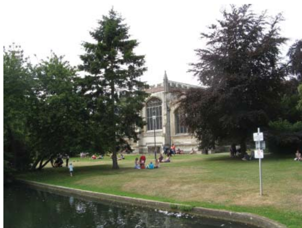
The Churchyard, St Mary's Church