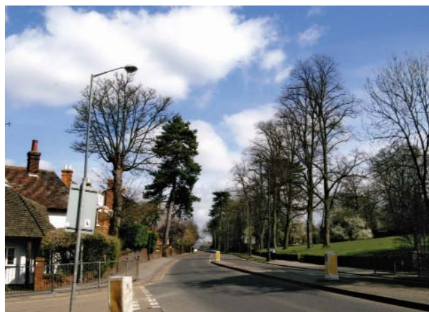
View along Walsworth Road