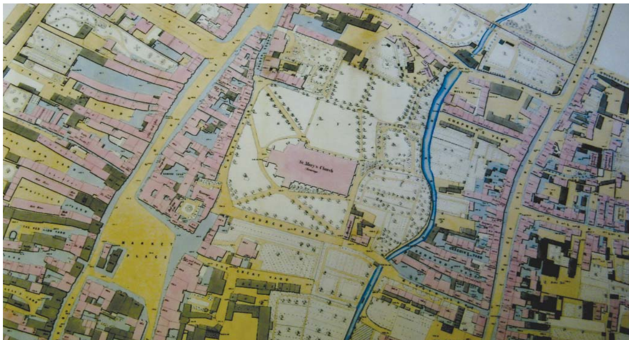
Historic Map of 1844

The earliest surviving plan of the town dates to c1750. However, the first, more accurate, map of Hitchin is dated 1816 and was surveyed by Attfield and Neale for the Hitchin Vestry, and copied by Henry Merett in 1818. It was the first plan of the town which had been prepared using modern surveying techniques and shows the long, thin burgage plots and how development was focused on the one main street (now Bucklersbury, Market Place, High Street and Bancroft) as well as a substantial group of buildings to the east of the church on the Wymondley Road. The large footprint of many of these buildings confirms that they were in industrial uses as well as residential. By this time, Tilehouse Street and Bridge Street formed part of the turnpike road from Welwyn to Bedford, the turnpikes being established between 1726 and 1757. The map also shows that some of the fields around Hitchin were still divided into the strips in the medieval way. In 1808 the Vestry paid for a new bridge to be built across the river in Port Mill Lane. This lane was essentially replaced in 1875 when Hermitage Road was built on a much grander scale to connect Bancroft to Queen Street.