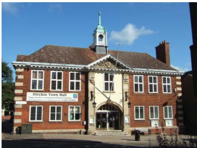
Hitchin Town Hall, Brand Street

Brand Street leads off High Street and represents a 19th century widening of a former alleyway. It has more mixed development than the other two streets, and has suffered from a greater degree of modern infilling or redevelopment. The western end of the street is dominated by Hitchin Town Hall, built in 1900 and grade II listed. To the north-west is the former Friends Meeting House (grade II listed and now known as Centenary House) and located almost opposite the Town Hall on the south side of Brand Street, is the former Town Hall of 1840 (now 'Ivory'), which is also grade II listed and provides a rare example in the town centre of a substantial, stuccoed building. The corner into Paynes Park is marked by an unfortunate red brick block of offices, four storeys high and dating to the 1970s or 1980s. Beyond the current Friends Meeting House (a BLI) and to the west, is Thomas Bellamy House, an early to mid 19th century yellow brick grade II listed building marking the entrance into the conservation area from this direction.