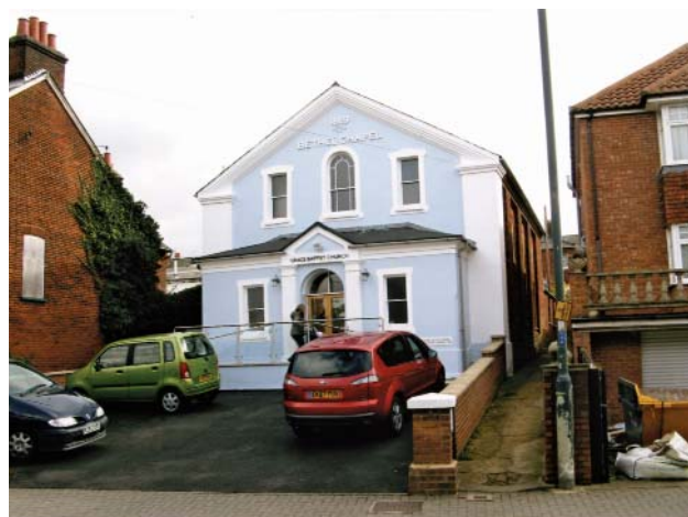
The Bethel Chapel, Queen Street