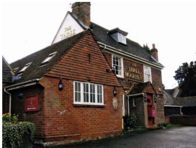
The Three Moorhens Public House

Landmark buildings make a significant contribution to this Character Area: The Three Moorhens Public House (grade II listed) performs an important 'gateway' function and The Priory is an important landmark building particularly when viewed within the park.