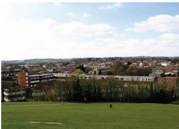
View over Hitchin from Windmill Hill