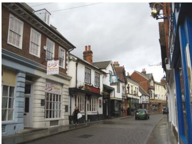
Historic inns in Bucklersbury

During the medieval period, the town's prosperity relied on wool, and the growing and selling of grain crops. Malting and brewing became the natural by-product of the latter. A fulling mill is recorded in 1268, suggesting that cloth making had also been established by this time. At one time Hitchin was selling fleeces to the continent through Calais, and a cloth making industry started in the town in about 1410. The vast revenues from local farms, some of which were owned by the monks, resulted in the extension and embellishment of St Mary's Church. When the monasteries were dissolved in the 1530s the land and buildings were sold off or gifted to the King's supporters, and by c1546 The Priory was in the hands of the Radcliffe family who rebuilt the main house in 1775, retaining some of the 15th century cloisters. The Quakers were already active in the town by the 1650s and by 1690 they had built a Meeting House in West Alley off Dead Street (now Queen Street), though this was demolished in 1869 after a new meeting house had been built. The influence of local Quakers on Hitchin life was very important throughout the 18th century and peaked between 1800 and 1875.