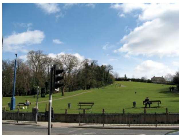
View up Windmill Hill