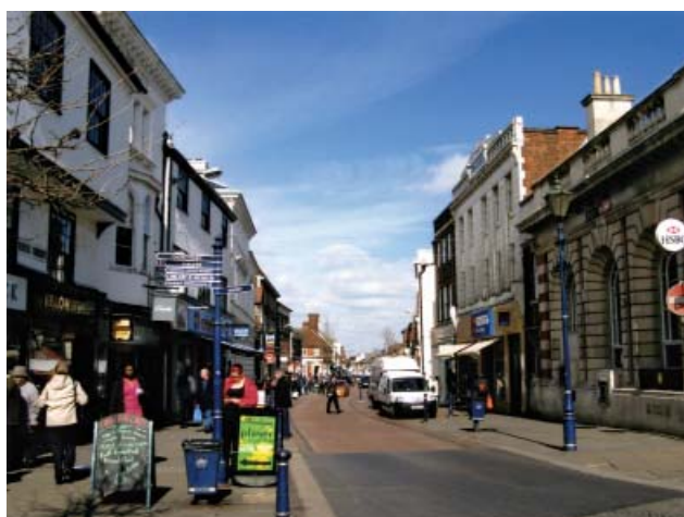
View along the High Street

This Character Area once formed part of the large market place to the west of St Mary's Church which was gradually encroached over, so that now the church is no longer visible from the High Street or from Bancroft, described by the architectural historian Sir Nicholas Pevsner as one of the best streets in of Hertfordshire. The street is wide and between Market Place and the junction with Brand Street, where High Street becomes Bancroft, has been subject to an environmental improvement scheme which provided a partially pedestrianised street. The uses are all commercial with residential uses above some of the shops. This is the major shopping area of Hitchin with national chains being represented. On-street short stay car parking is a useful shoppers' facility, but does encourage circulating traffic looking for free parking – this can lead to pedestrian and vehicular conflict. These issues were identified by stakeholders in relation to the Hitchin Urban Transport Plan that has been endorsed by Hertfordshire County Council's Highways and Transport Cabinet Panel.