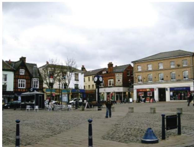
Traditional paving in the Market Place