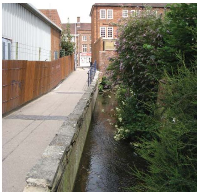
The River Hiz