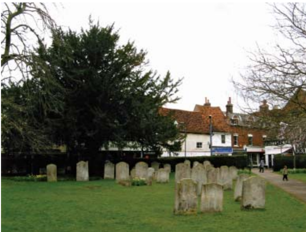
View across churchyard to Munts Alley