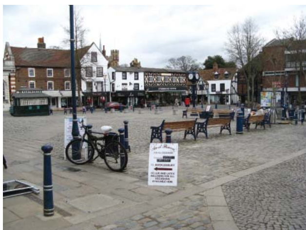
The Market Place looking towards St Mary's Church