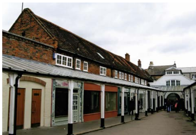
Arcade Walk (BLI)

In conjunction with a review of Hitchin Conservation Area and with the assistance of the Hitchin Historical Society, the District Council has reviewed the existing Register of Buildings of Local Interest (BLI's). A total of 96 buildings are now included in the Register. There is presumption that all locally listed buildings will be retained, and the District Council will also assess applications for alterations or extensions to such buildings particularly carefully.