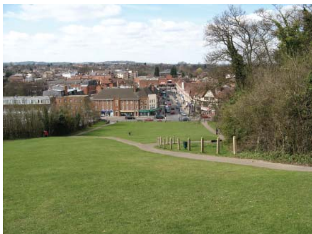
View over Hitchin from Windmill Hill

Hitchin Hill and Windmill Hill contain the historic town on the east, which was originally developed along the route of the modest stream called the River Hiz. In places this is now culverted but recent improvements to its setting and accessibility have been provided as a result of new development, most notably to the east of Bancroft, where a new Sainsbury's Supermarket was built in the late 1990's. Priory Park lies to the south of the town centre, with Butts Close to the west. Further to the west of Hitchin the land also rises gradually before a steep incline which is marked by the small village of Great Offley. To the north, the ground levels off and follows the course of the River Hiz, which joins the River Purwell at Grove Mill and the River Oughton near Ickleford, the combined river then flowing northwards to the Great Ouse and The Wash.