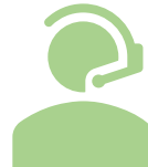
Employee assistance programme