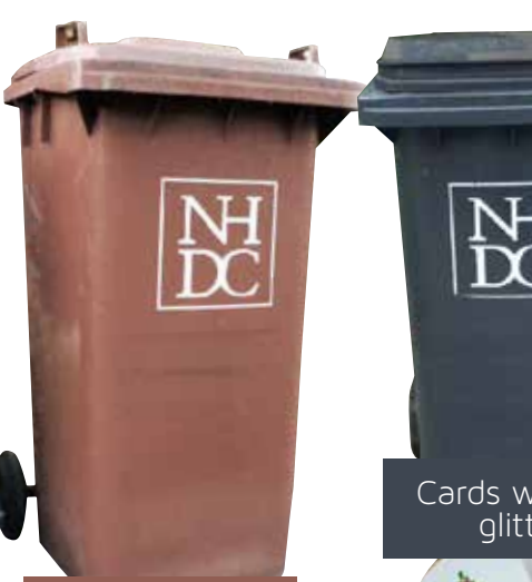
Real Christmas trees without decorations